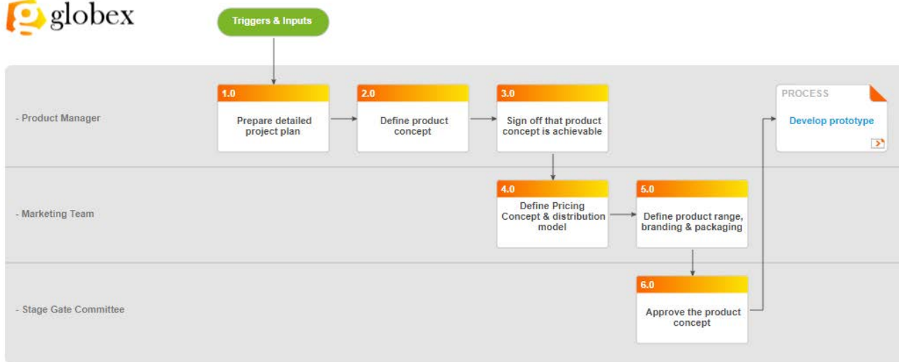
An embedded process